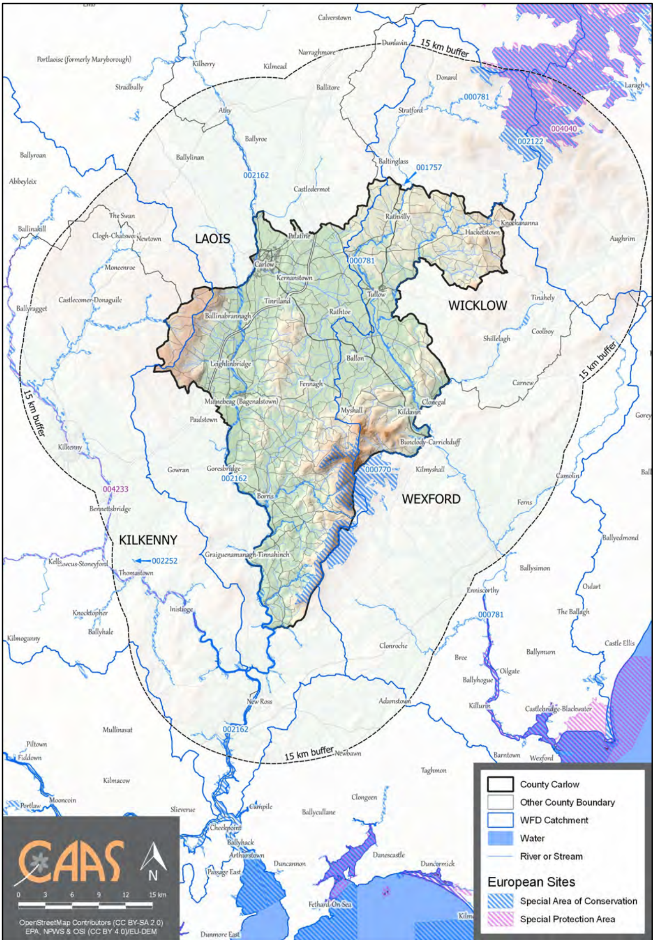
Figure 3.1 European Sites within 15 km buffer zone of County Carlow