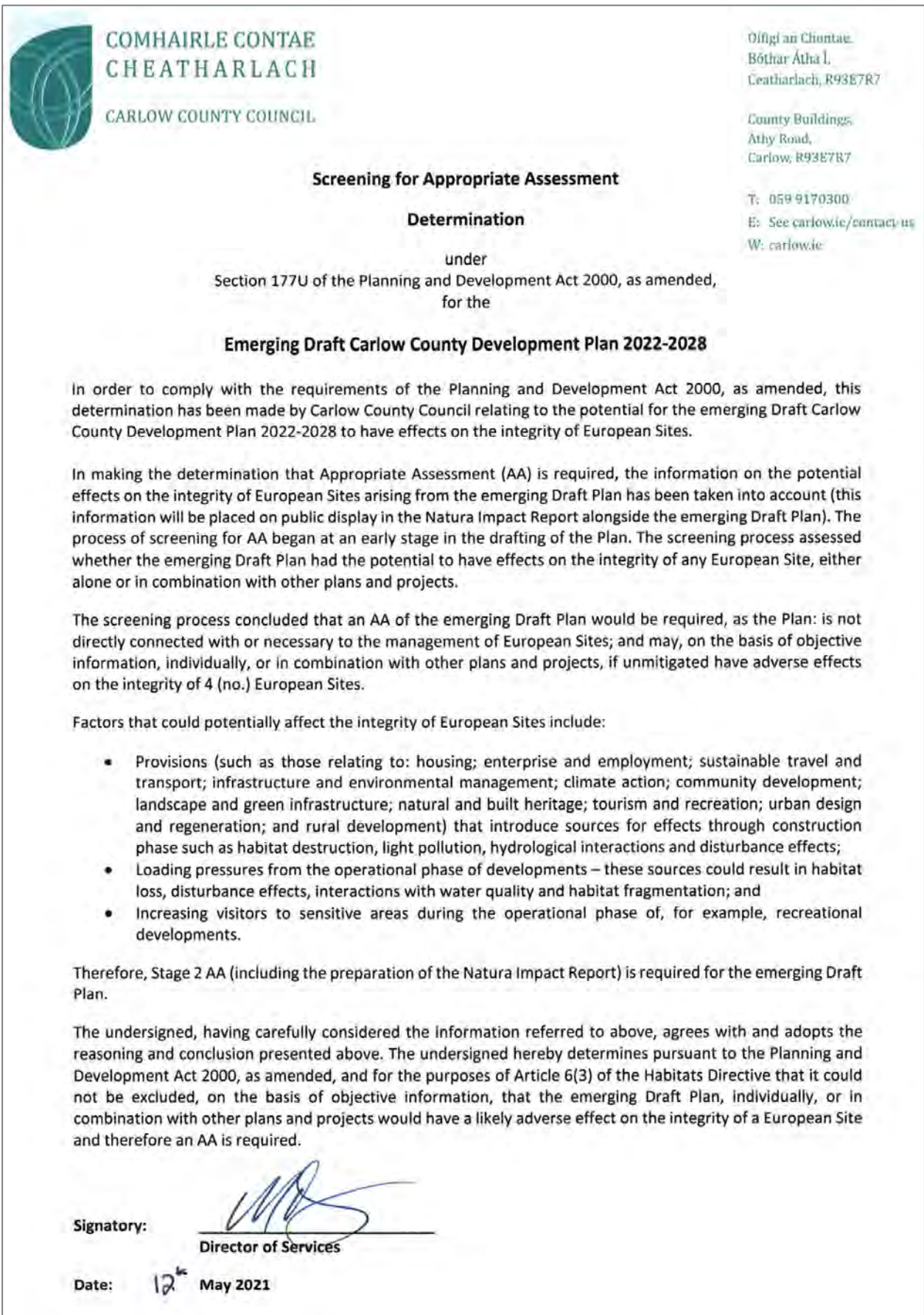
Figure 3.3 Screening for Appropriate Assessment Determination