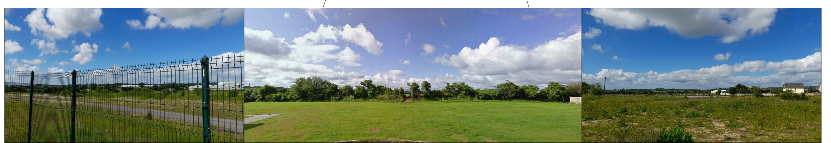
Views of Bagenalstown Industrial Park and Subject Lands from Housing to North

All dimensions to be checked on site. Figures dimensions shall preference over scaled dimensions. Any errors or discrepancies to be reported to the Architect. The drawings may not be edited or modified by the recipient. Copyright and ownership of this drawing is retained by STRUTEC. No part of this drawing may be reproduced or transmitted in any form or by any means electronic or mechanical, including photocopying, recording, or by any information storage and retrieval system, without the prior written consent of STRUTEC. All rights reserved by the law of copyright and by international copyright. Conventions are referred to STRUTEC and may be corrected by court proceedings for damages and/or expenses and costs.