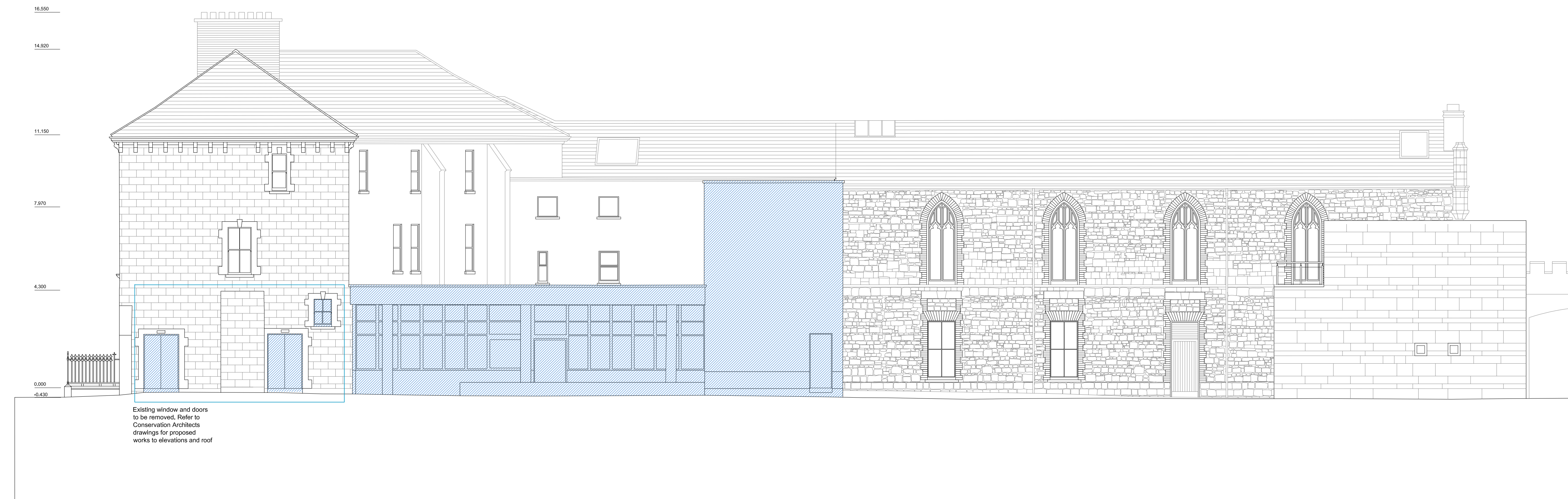
2 113 EXISTING EAST ELEVATION 1:100