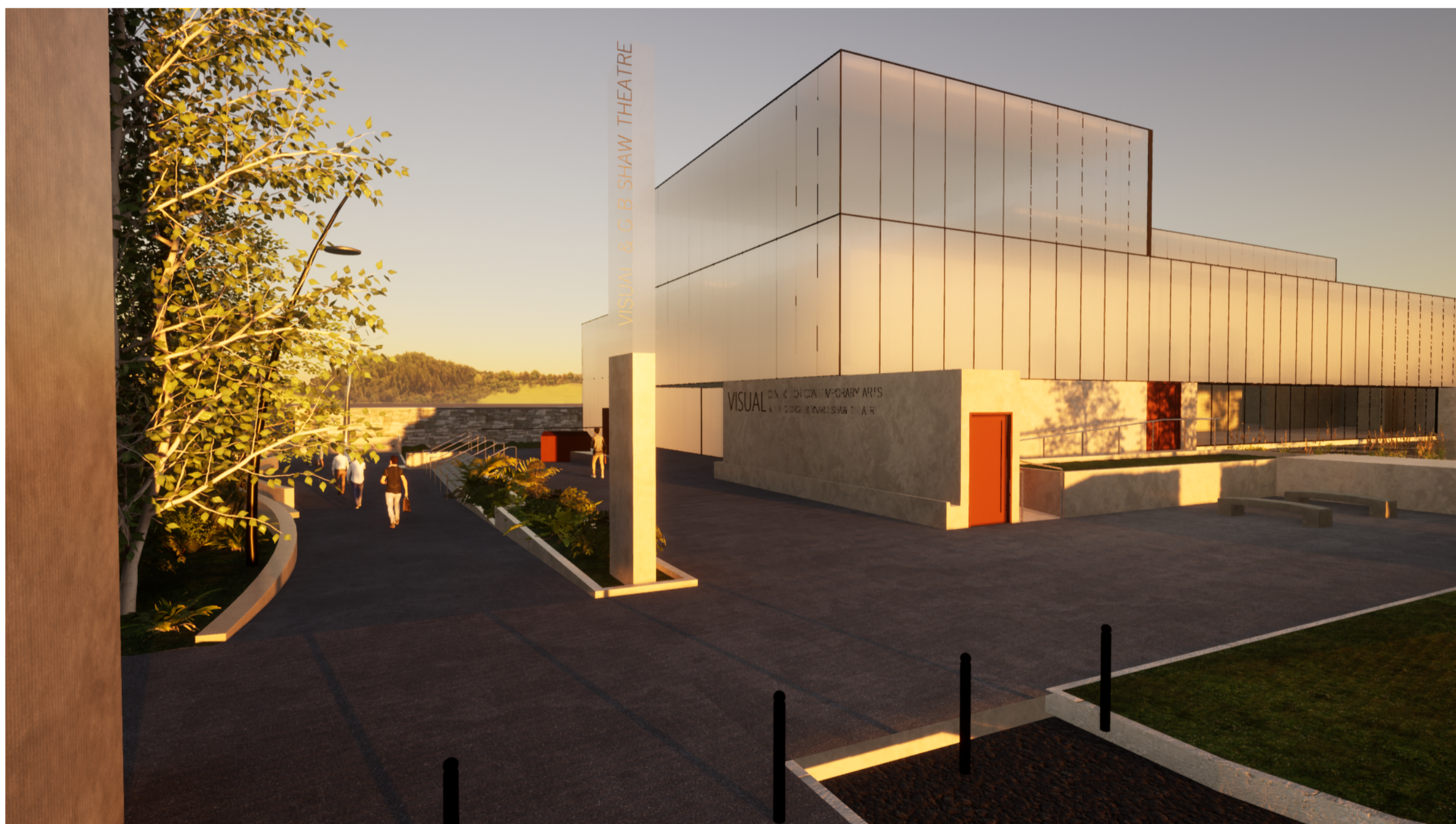
3 202008 Visual Public Realm Low Light210302-016 CM 1:2.08