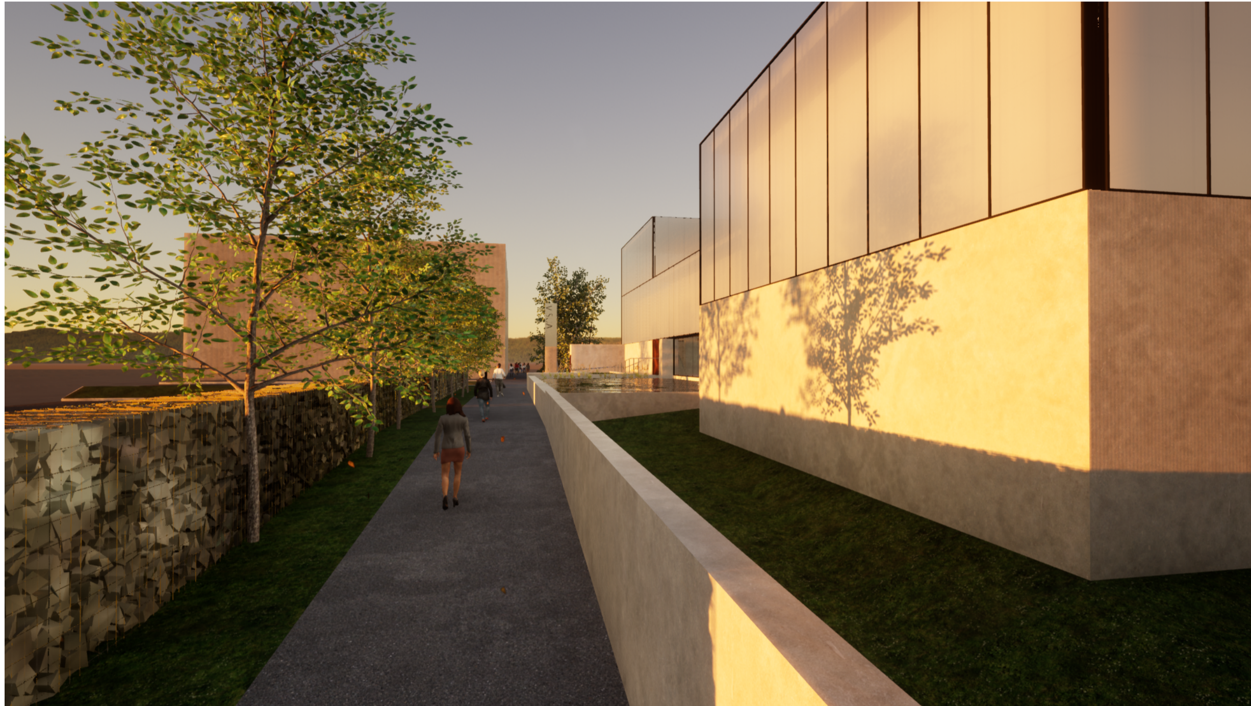
1 202008 Visual Public Realm Low Light210302-013 CM 1:2.08