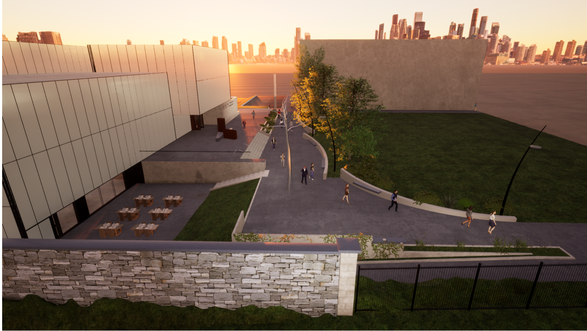
1 202008 Visual Public Realm Low Light210302-002 CM 1:2.08