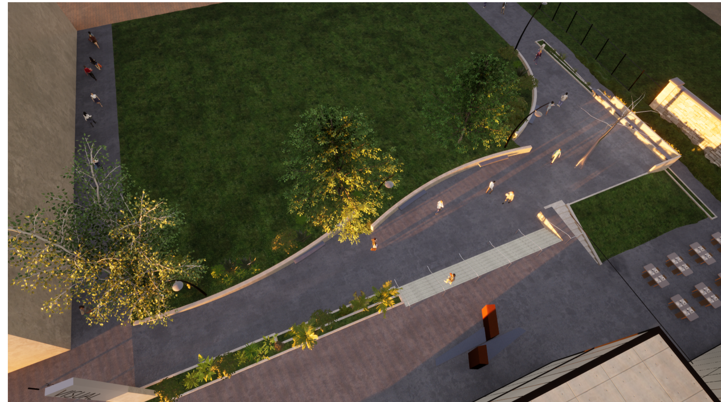
4 202008 Visual Public Realm Low Light210302-021 CM 1:2.08

These drawings and the work, information and design contained therein are the copyright property of Carlow County Council. They shall not be reproduced, stored in a retrieval system, or transmitted in any form or by any means, electronic, mechanical, photocopying, recording, or by any information storage and retrieval system, without the prior written permission of Carlow County Council. Any license to use these drawings shall be granted by Carlow County Council and shall be subject to the compliance of the conditions contained or implied within the contract between Carlow County Council and the "assigned representative". Do not take scaled dimensions from these drawings. Figured dimensions only to be used. These drawings are to be used for the sole purpose of construction or certification purposes when they cannot be used for tendering. If for Planning purposes then they cannot be used for the sole purpose of construction or certification purposes. Copyright © 2021 Carlow County Council