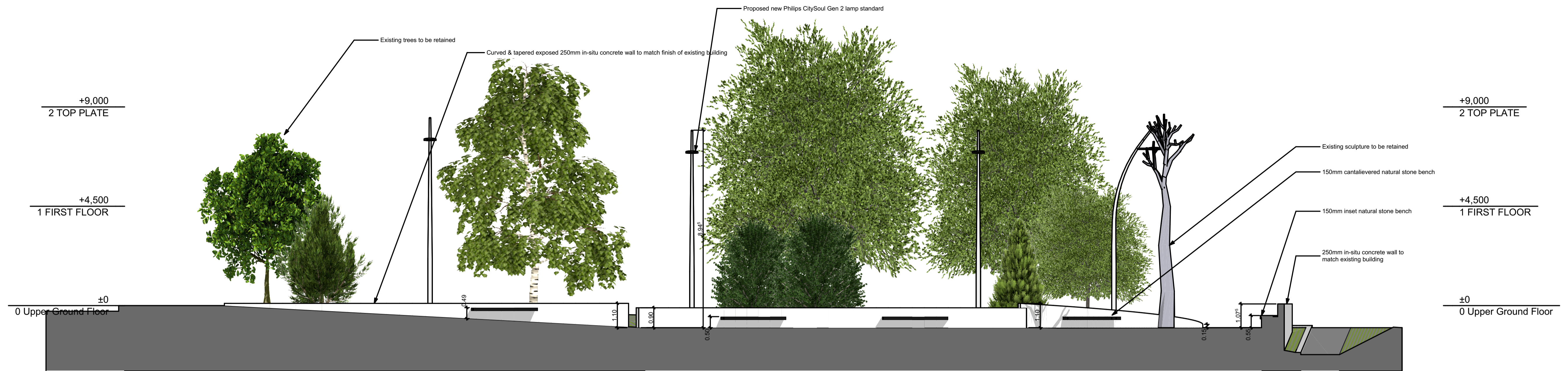
North Facing Elevation of Curved Walls (Footpath Side) - Proposed 1:100