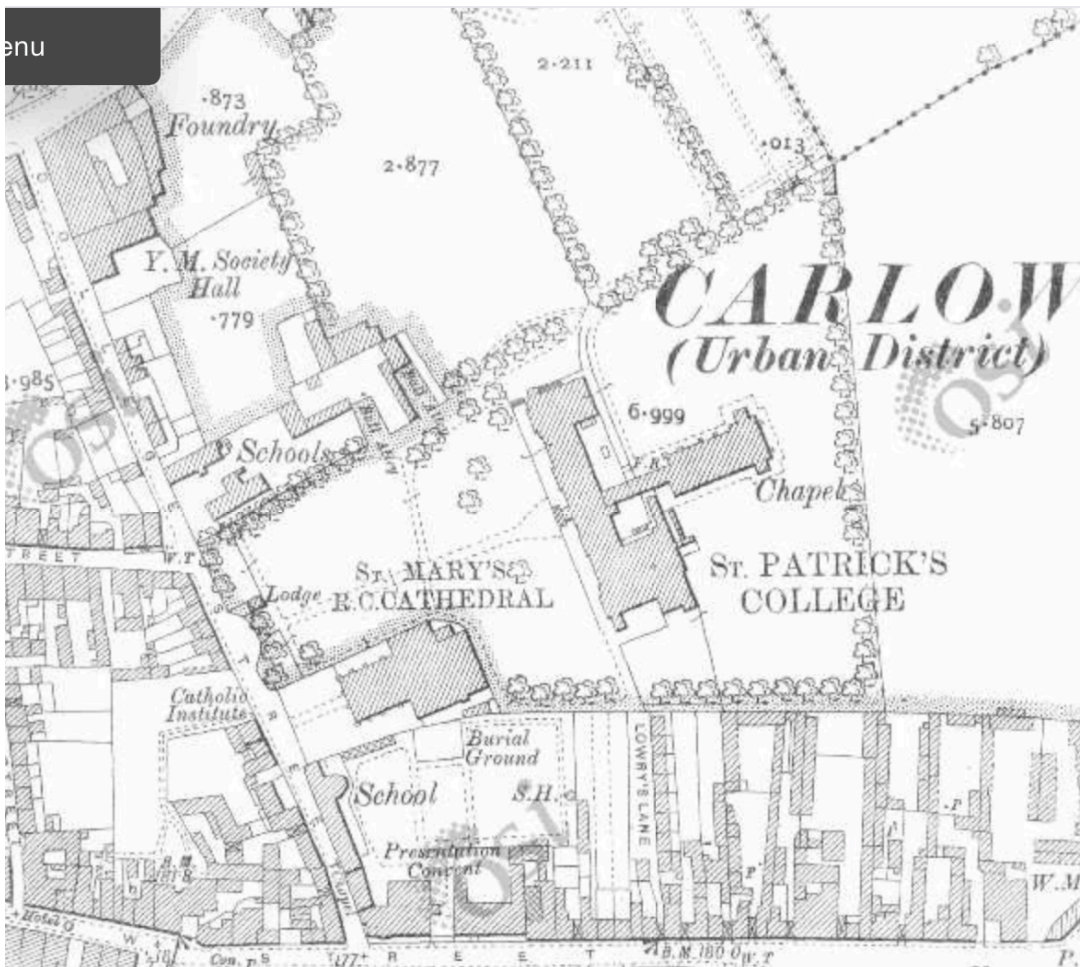
2nd Ed OS map c 1900