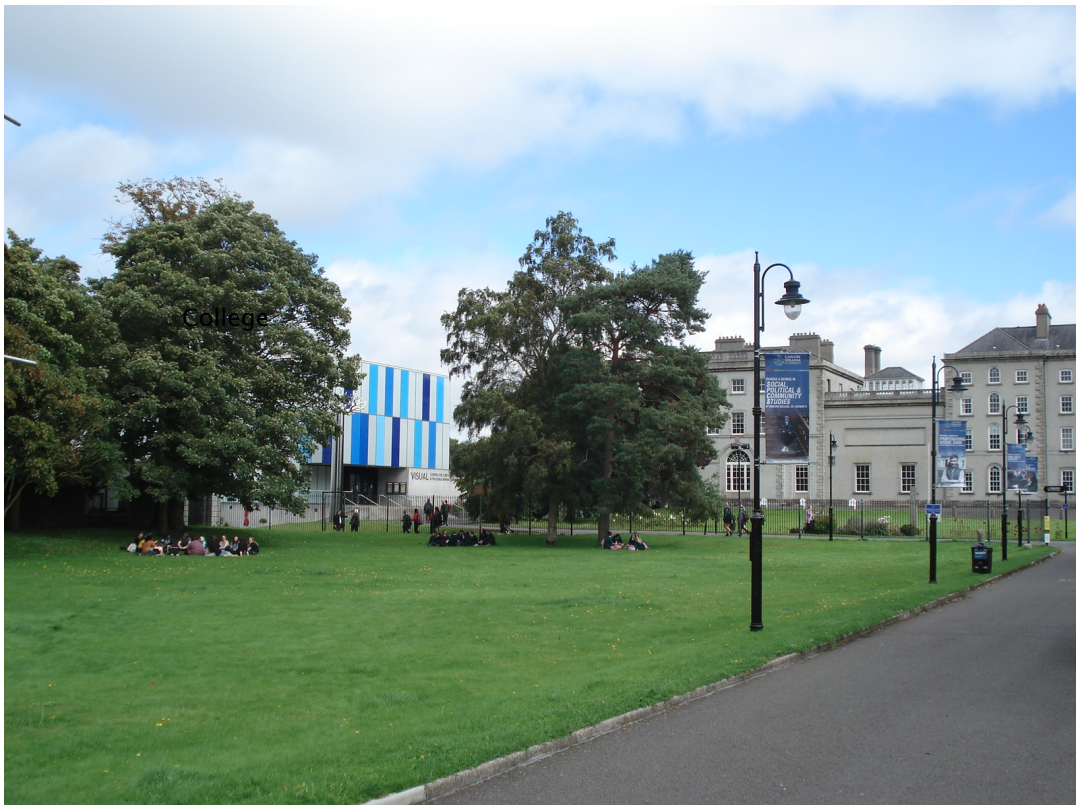
View of VISUAL and college from entrance at College St