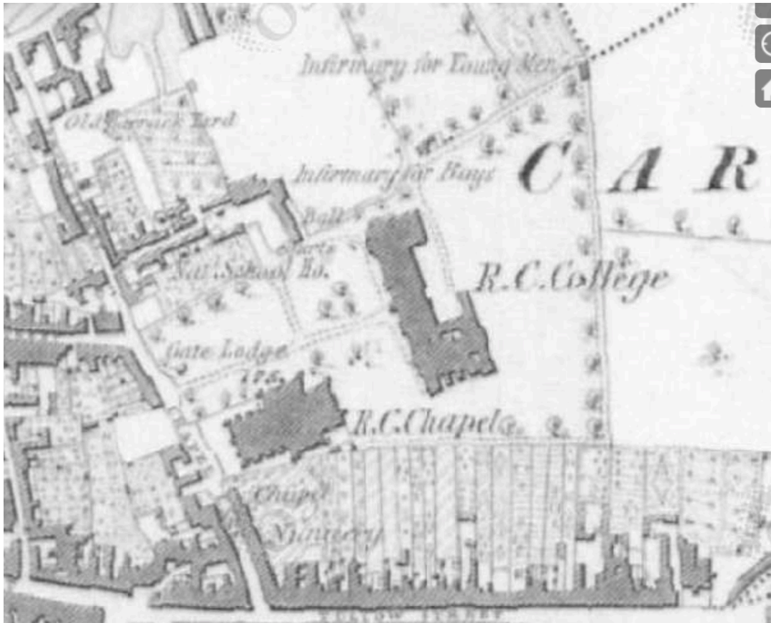
1st Ed OS map c 1840