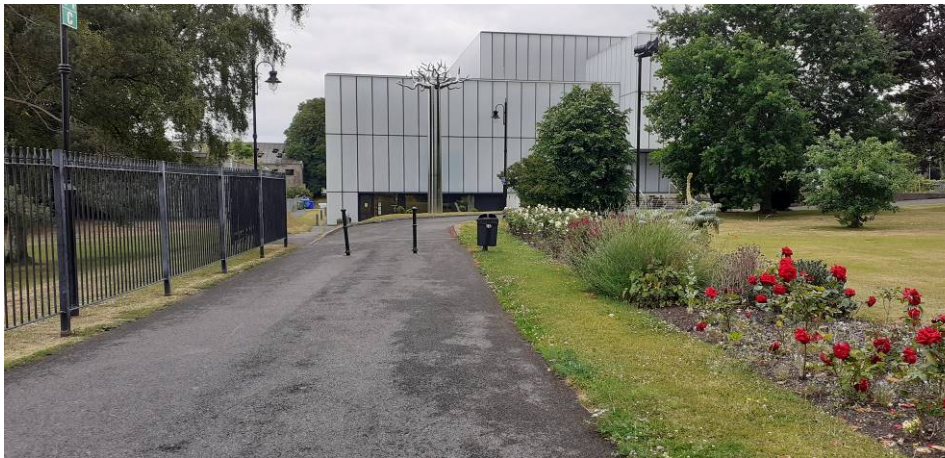
Photoplate 3. Proposed site in a northerly direction, indicating access to front of St Patrick's College.