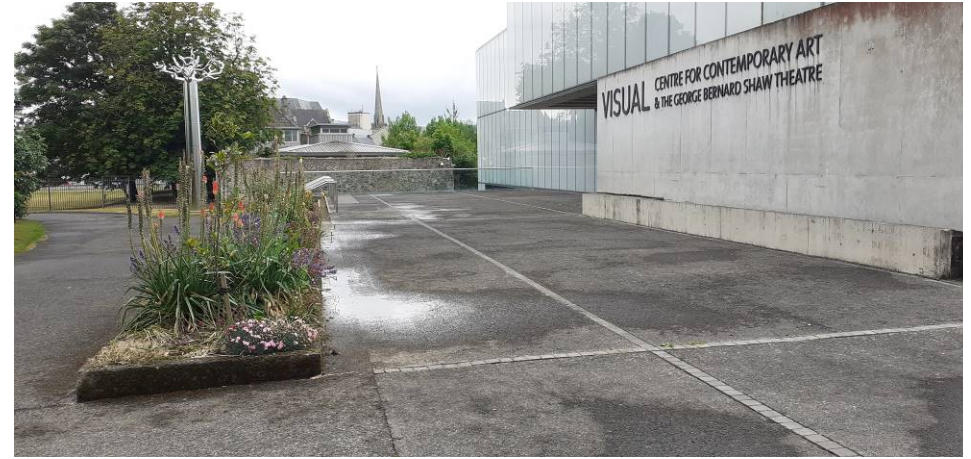
Photoplate 2. Proposed site in a westerly direction. Forecourt of Visual Arts Centre.