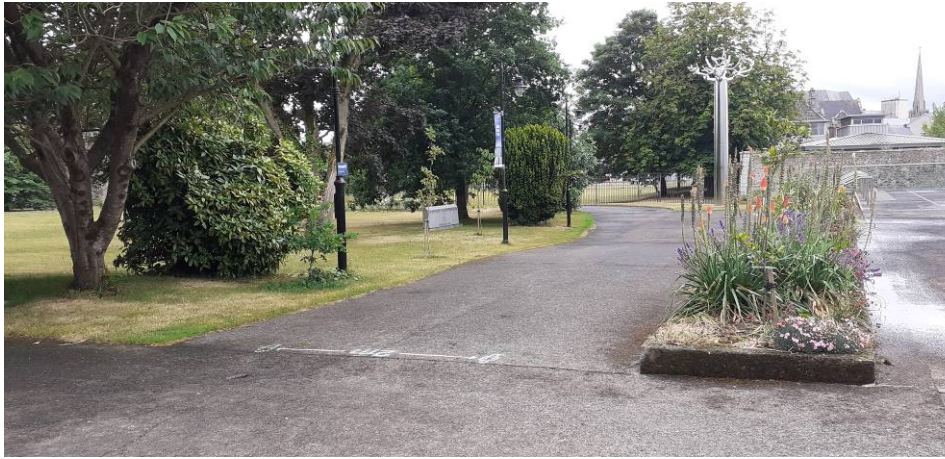
Photoplate 1. Proposed site in a westerly direction.