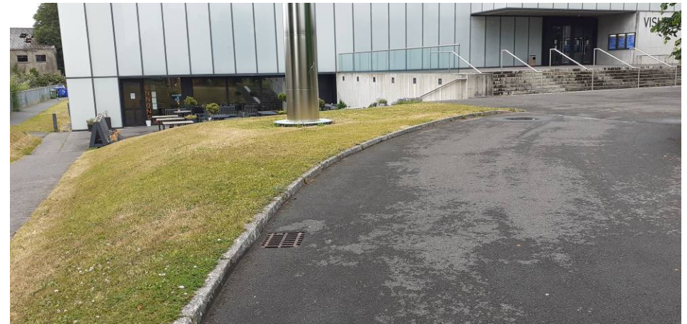
Photoplate 4. Grass area around Medusa Tree sculpture for replacement with granite paving.