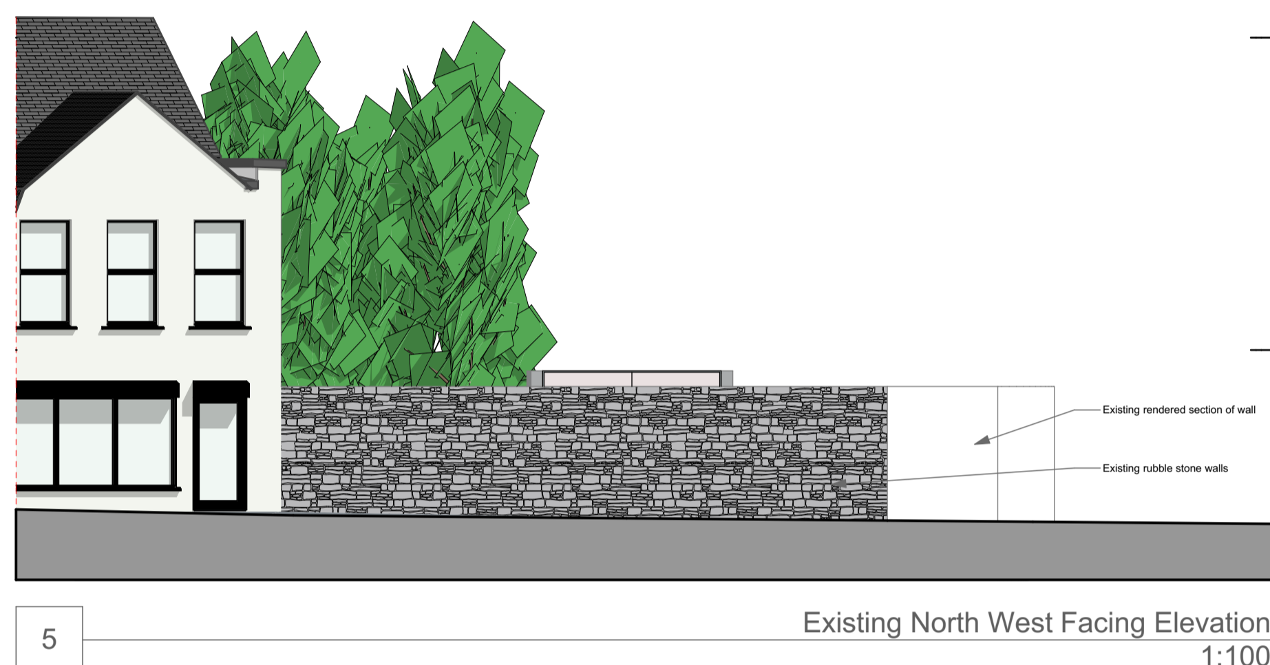
Existing North West Facing Elevation 1:100