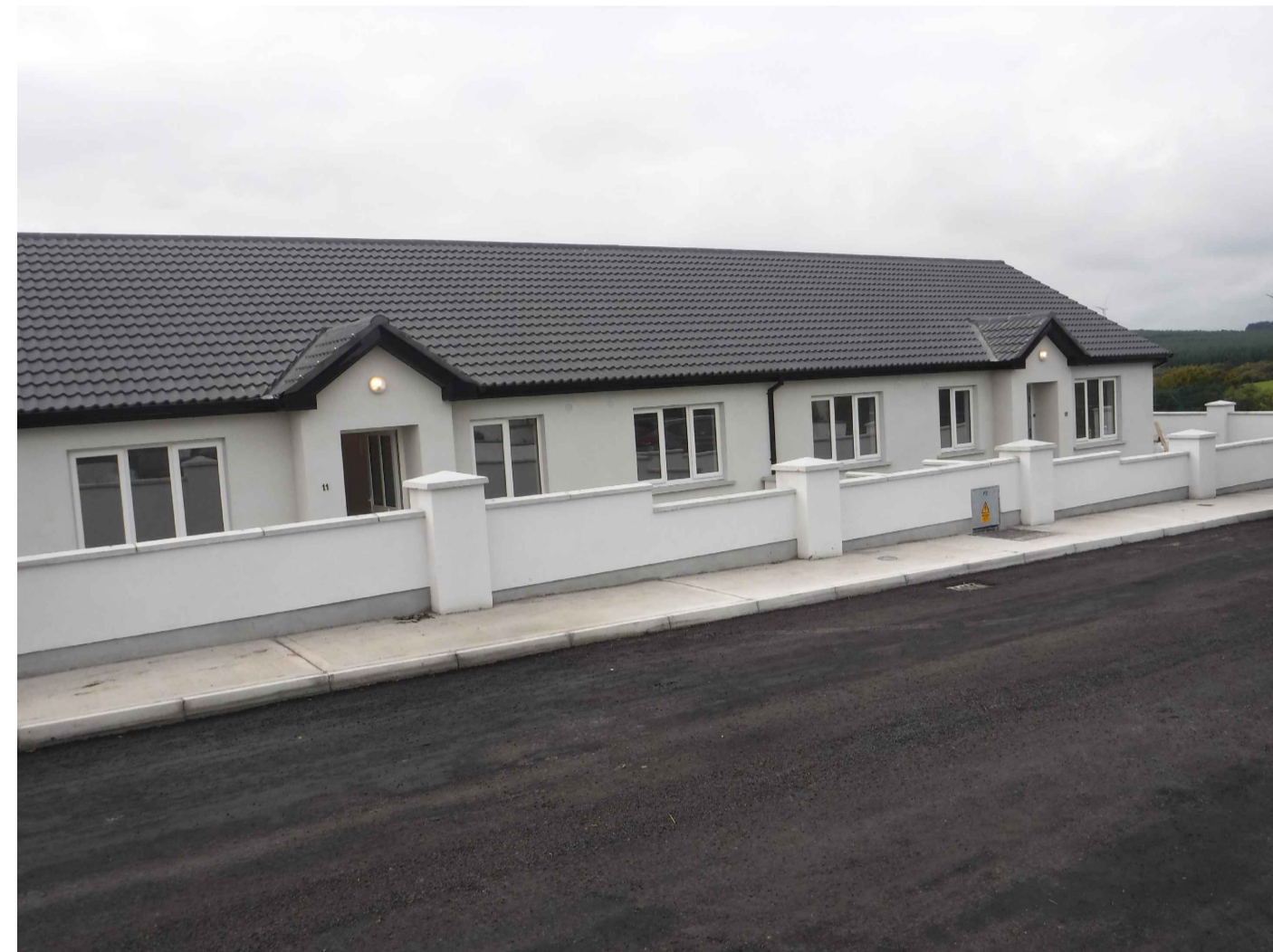
IMAGE OF DWELLINGS 11 & 12