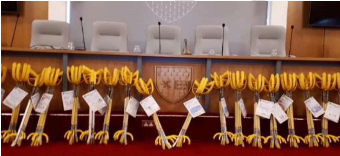
Anti-Cigarette Litter Campaign