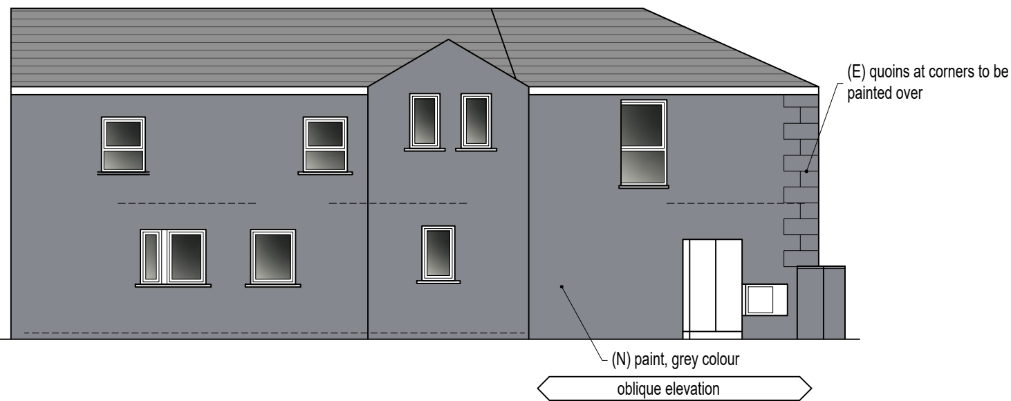
2 East elevation - proposed scale 1:100