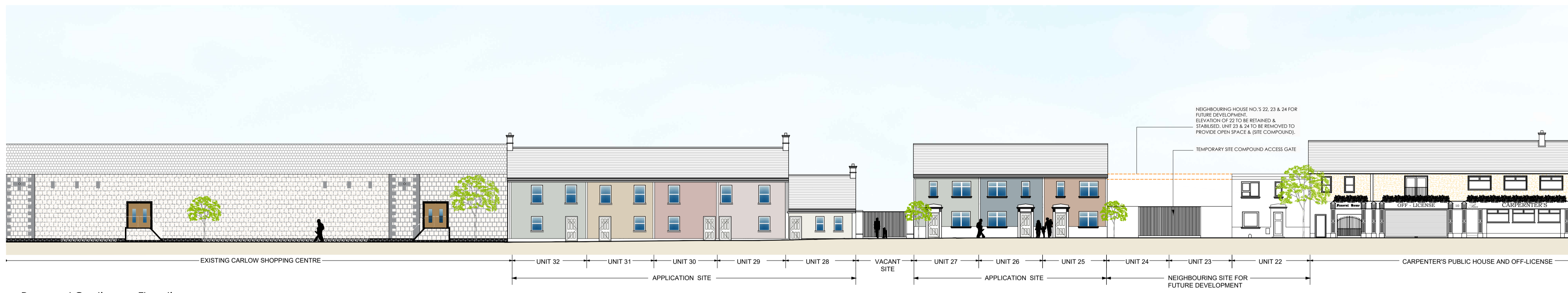
Proposed Contiguous Elevation Scale: 1:200