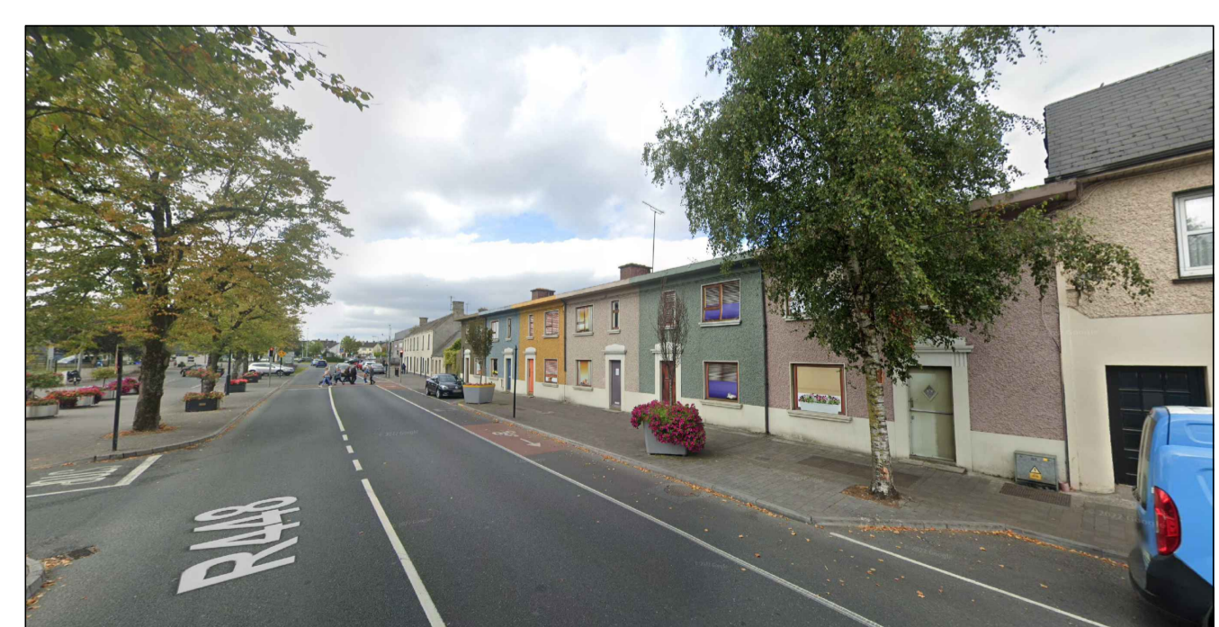
Existing View from North East end of Barrack Street Scale: N/A