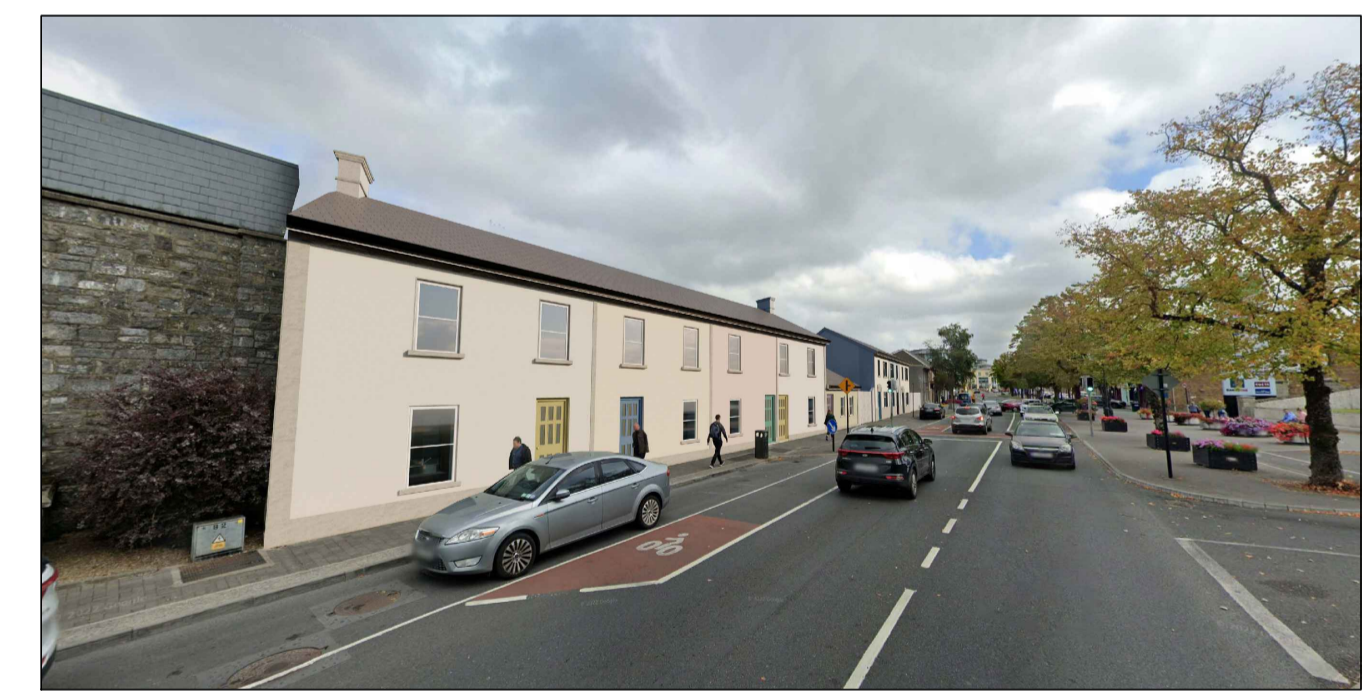
Proposed View from South West end of Barrack Street Scale: N/A