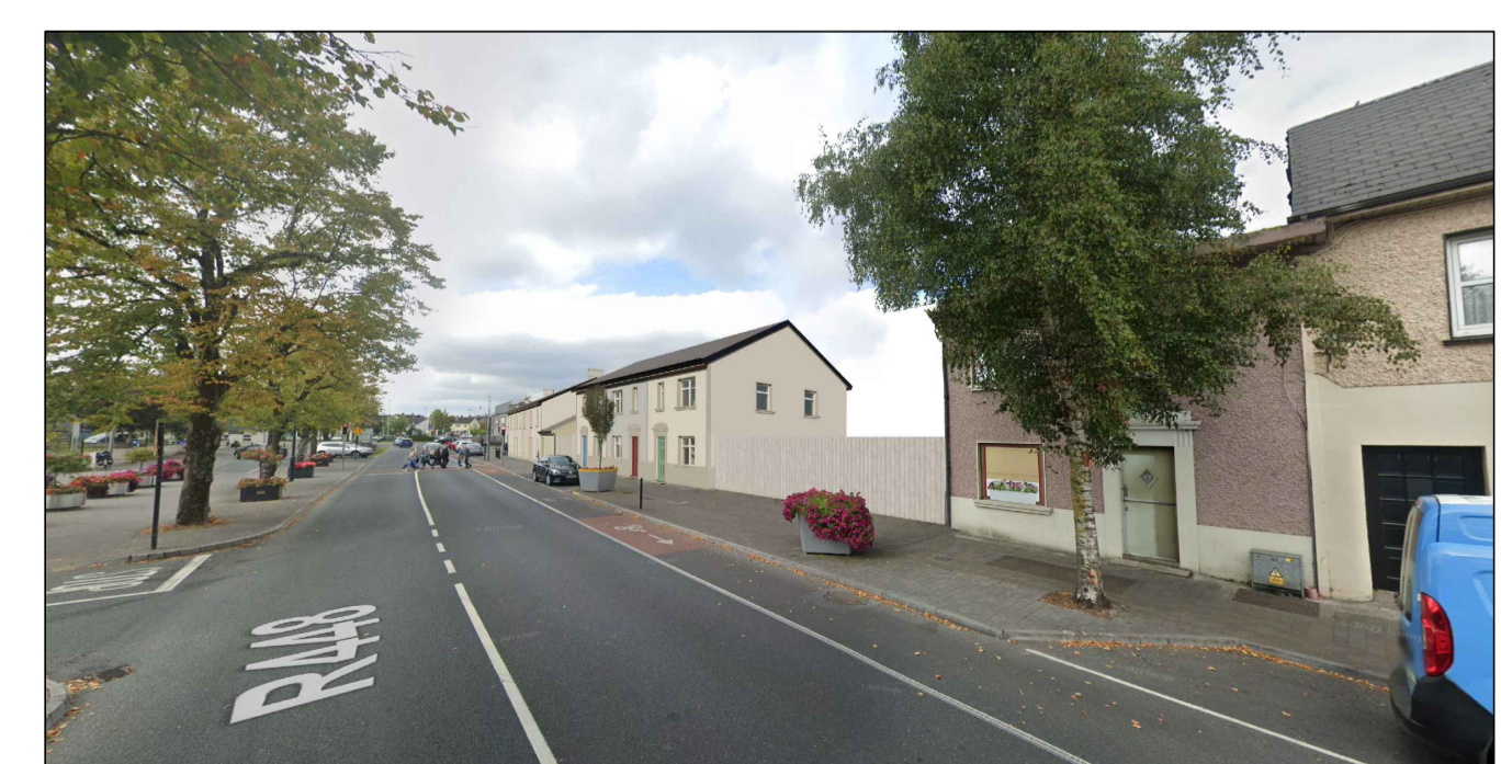
Proposed View from North East end of Barrack Street Scale: N/A