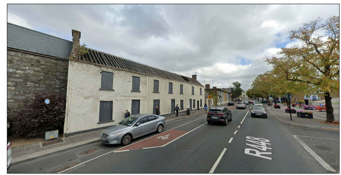
Existing View from South West end of Barrack Street Scale: N/A