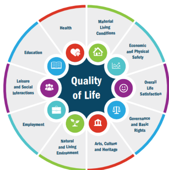
Figure 8.1: Elements Supporting Quality of Life.

meet the diverse needs of the people within existing and future communities. Effective sustainable and inclusive communities are interlinked with improving the quality of life for everyone within the community, with promoting inclusion by offering choice and accessibility to facilities and services for everyone, and by providing a vibrant economy while protecting the environment. Depending on a person’s own circumstances, the elements that support quality of life can differ, but can generally be categorised as per Figure 8.1.