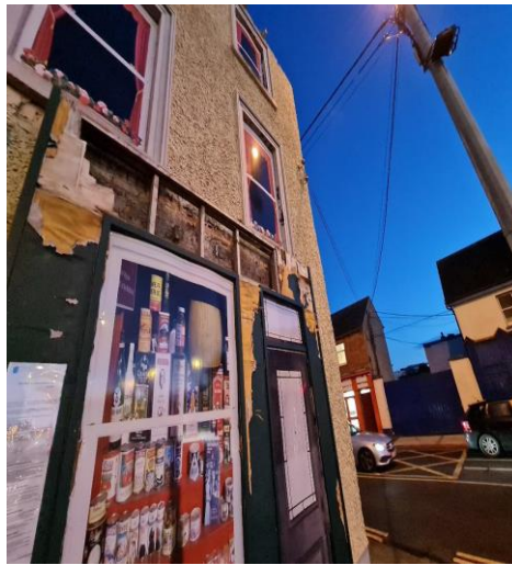
View of No. CT 93 on right