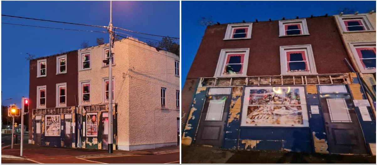
View of CT. No. 94 on left

(No.83) To Delete CT 94 from the Record of Protected Structures, Appendix VIII (page 86), deleted text in red: