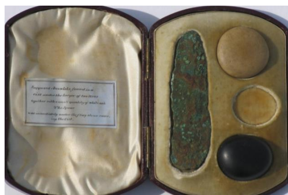
Razor-knife and 2 of 3 polished pebbles (supposed amulets) in bespoke 19 th century display case found in cist on Ballon Hill

From 2200 BC Ballon Hill was a focal point for burial in the south east of the county and is one of the only known barrow cemeteries in the region. At 130 metres above sea level, the hill provides extensive views of the surrounding countryside. Refer to Chapter 10 of this Plan which outlines policies and objectives for protecting archaeology within the county.