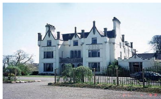
Ballykealey House

Ballon is an historic settlement, having originally formed part of the (former) Ballykealy estate. The original 300-acre estate of Ballykealy was the seat of the Lecky Family from 1649, when Cromwell granted lands at Ballykealy along with lands at Kilnock, Carlow. The estate remained in the Lecky Family until 1953 and was then sold to the Land Commission.