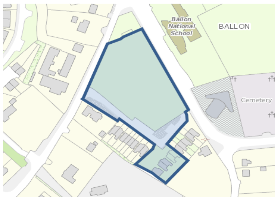
Map 15.3.3.1: Intervention Area – Laragh Beg Site

appearance of the area. It is an objective of the Council to seek completion of this site which has potential to deliver new residential development that will harness the opportunity of a prime location next to the town centre, the local primary school and community centre.