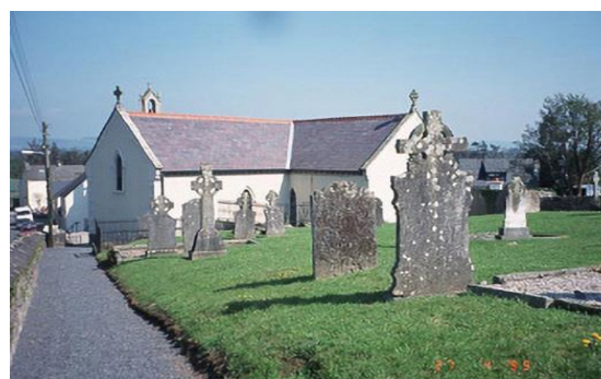
St. Peter and Pauls Catholic Church

Ballon contains a number of structures and features which are recorded in the Record of Protected Structures, and by the NIAH (See Table 15.3.3.1). Chapter 10 of this Plan outlines policies and objectives for protecting architectural heritage within the county.