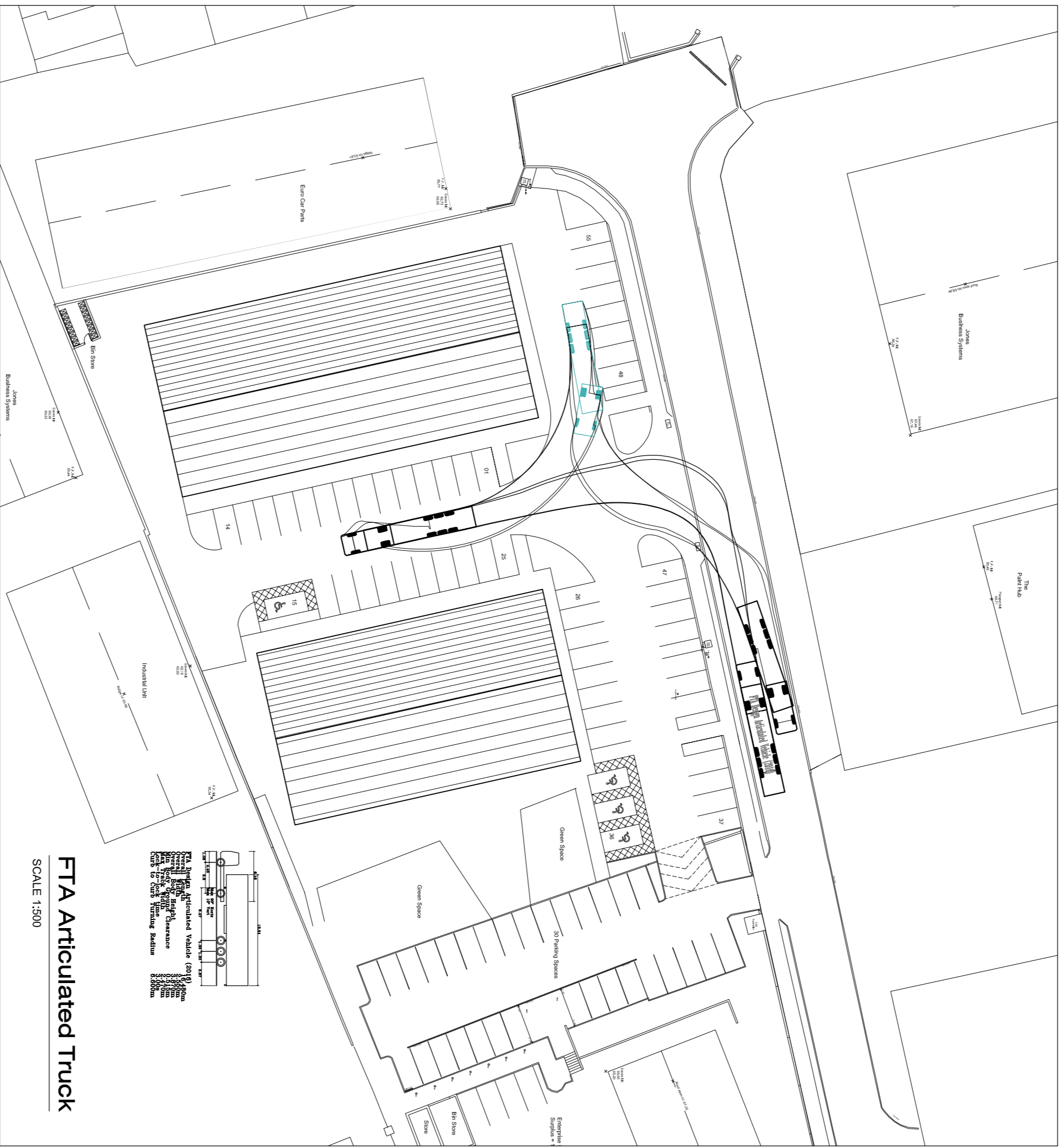
FTA Articulated Truck SCALE 1:500