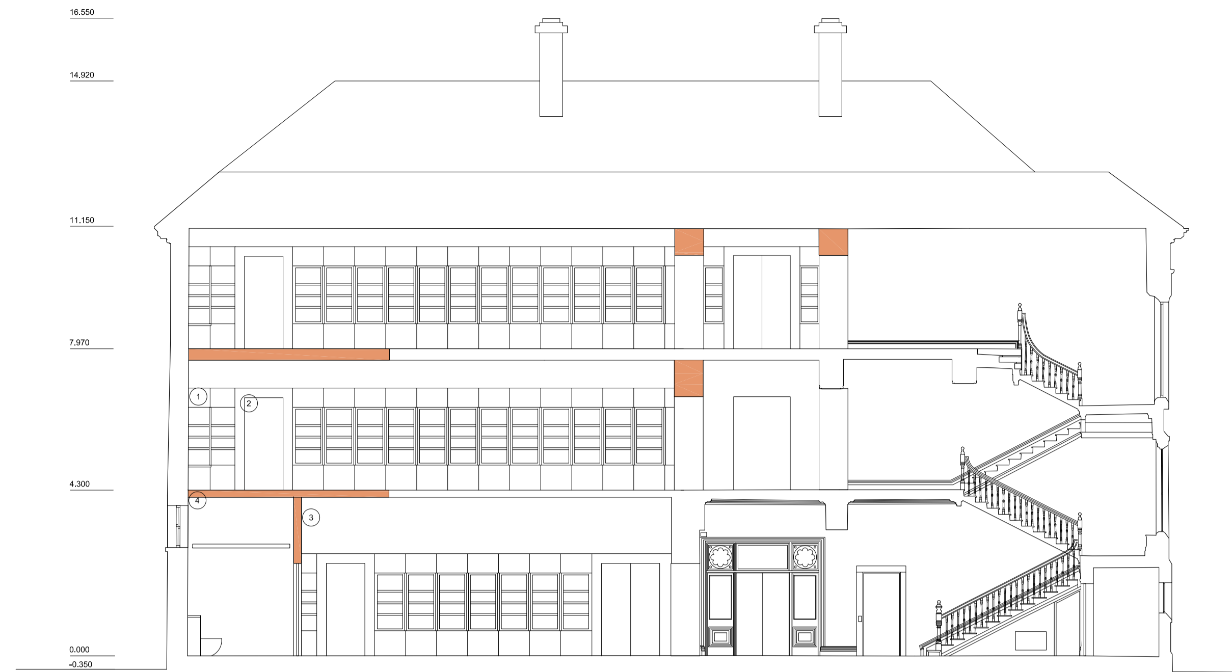
1 134 PROPOSED SECTION G-G 1:100