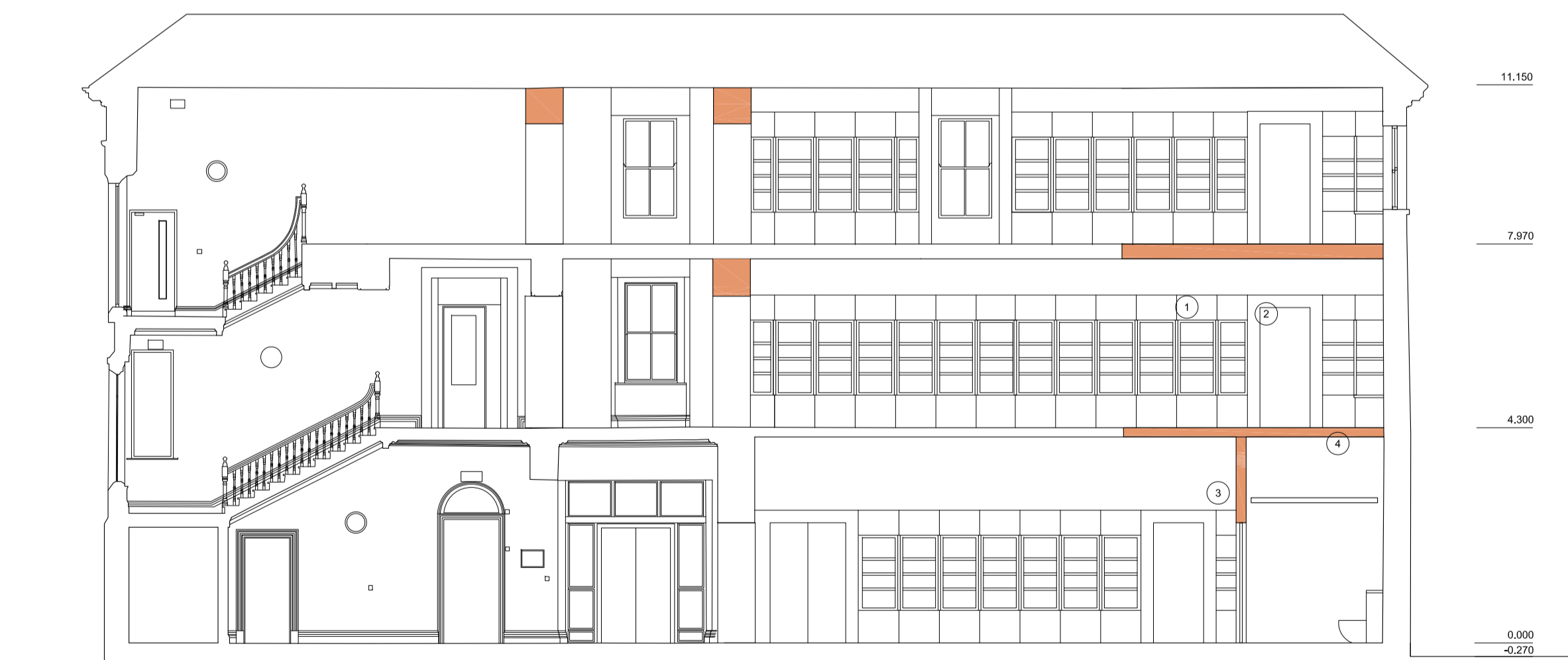
3 134 PROPOSED SECTION H-H 1:100