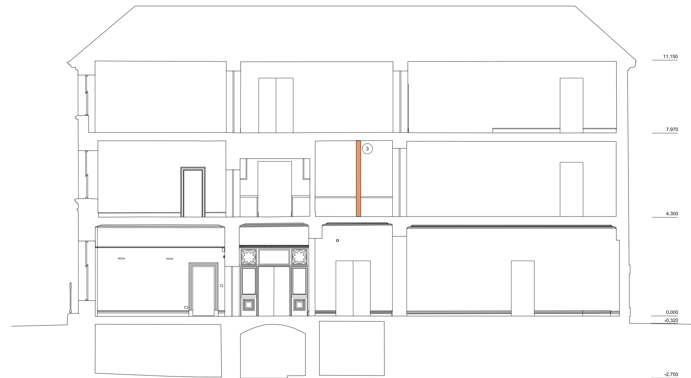
4 134 PROPOSED SECTION K-K 1:100