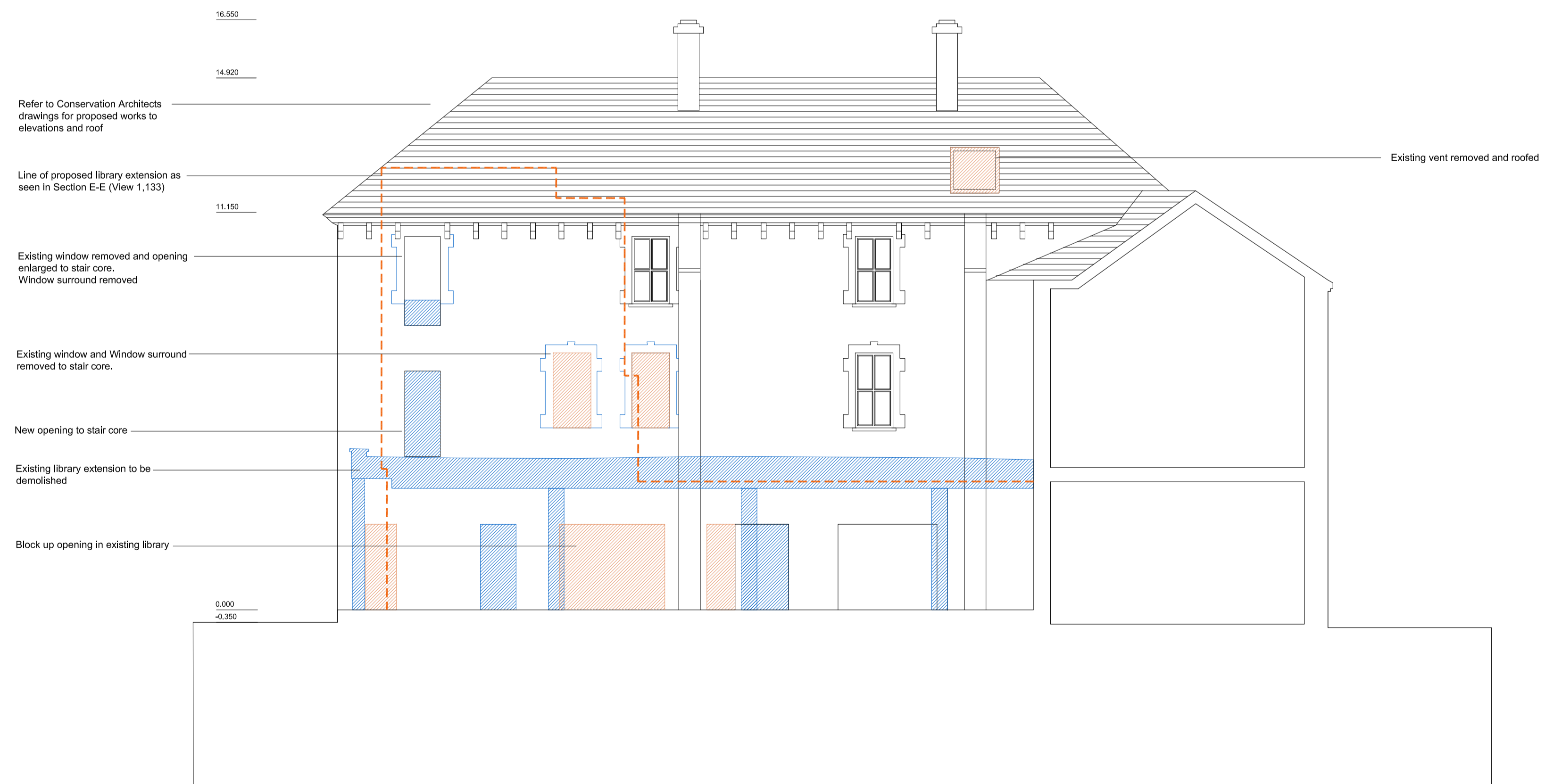
2 133 PROPOSED NORTH ELEVATION ALTERATIONS TO PRESENTATION BUILDING 1:100