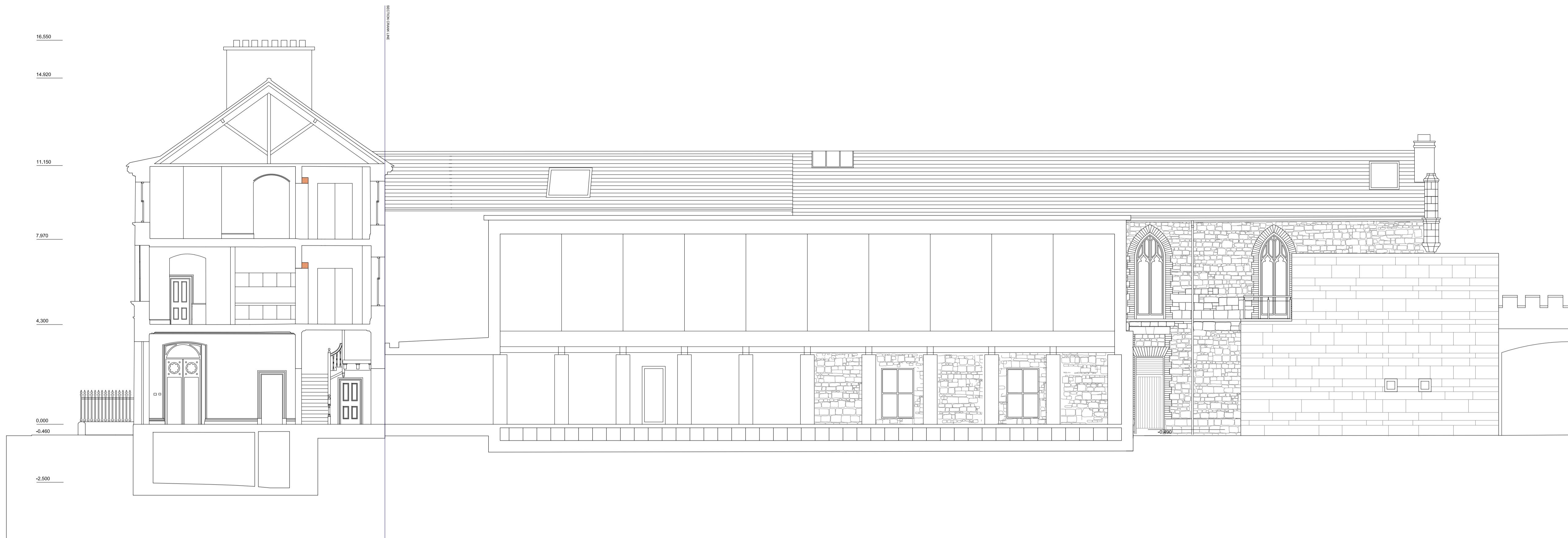
1 PROPOSED SECTION B-B 1:100