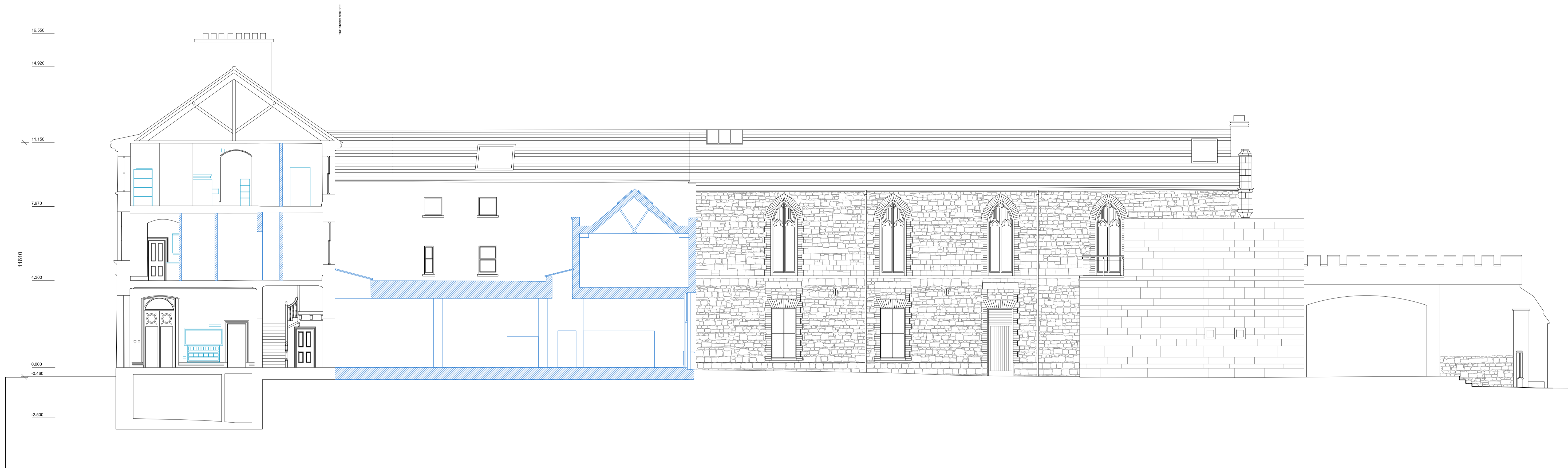
1 115 DEMOLITION SECTION B-B 1:100