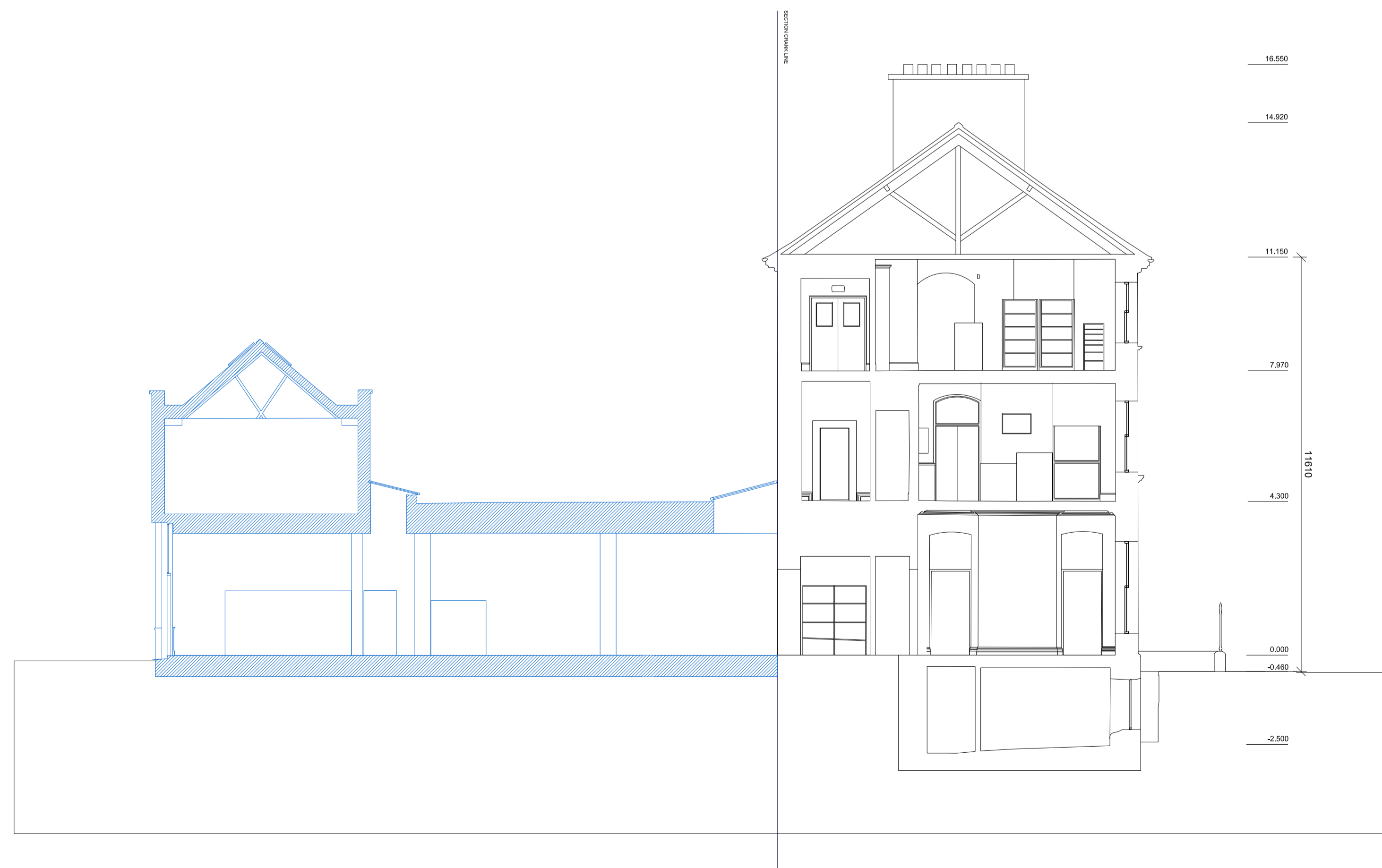
2 115 DEMOLITION SECTION D-D 1:100