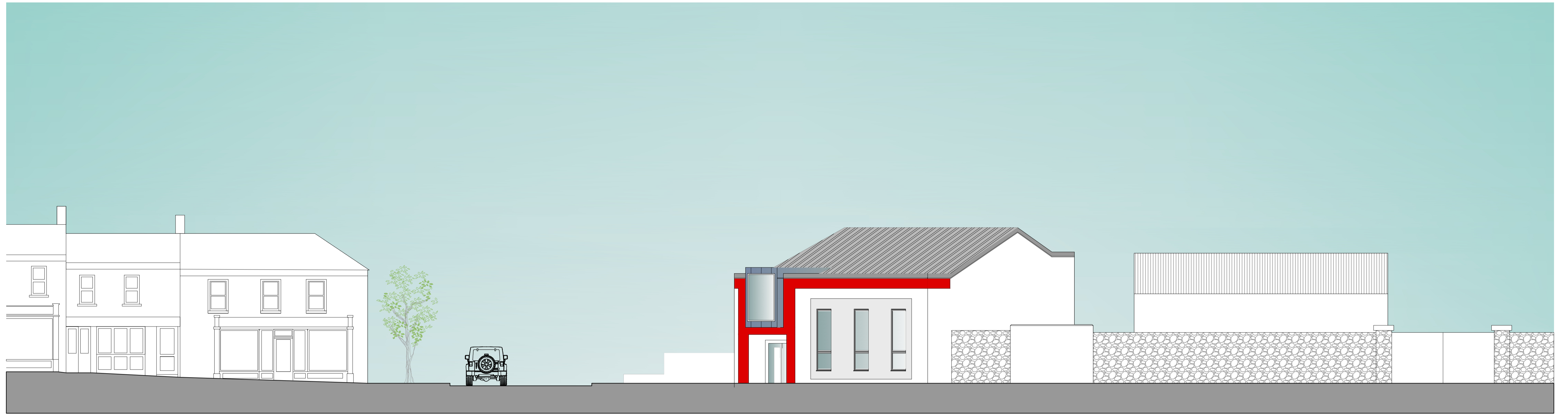
PROPOSED EAST ELEVATION (CHURCH ROAD - HIGH STREET)