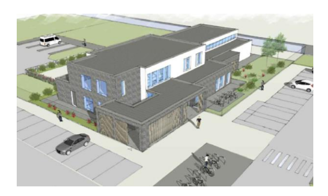
Social and Community Facilities – Policies

It is the policy of Carlow County Council and Laois County Council to: