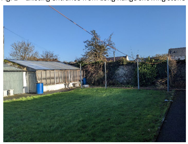
Fig. 3 – Existing green open space to be retained.